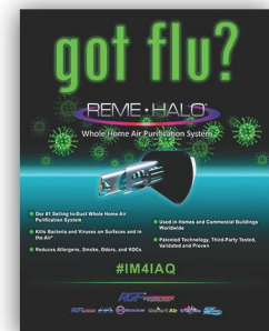
Counter Display (insert seasonal design)

8 x MICROCON 600 at 5 pts each = 100 pts