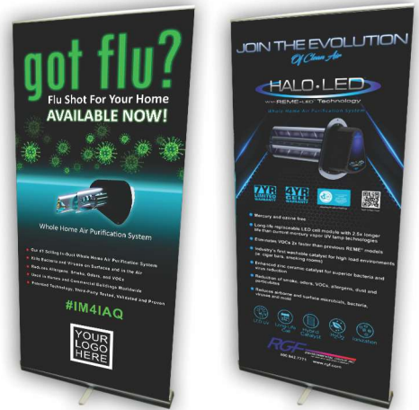
Pull-Up Banner (seasonal design)