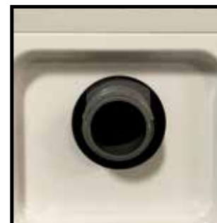
Optional Direct Drain Connection