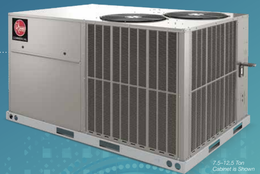
7.5–12.5 Ton Cabinet is Shown

With industry-leading efficiencies of up to 14.8 IEER, the Renaissance Line may qualify for a variety of utility rebates—helping your business realize substantial savings for a greater return on investment—at purchase and year after year.