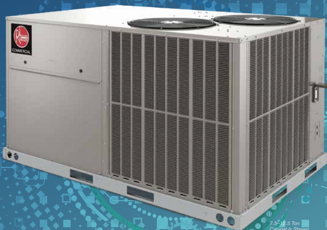
7.5-12.5 Ton Cabinet is Shown

The all-new Rheem® Commercial Renaissance™ HVAC Line