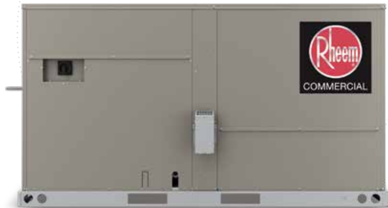
7.5–12.5 Ton Cabinet is Shown

A refined solution to make replacement, installation and service faster and easier.