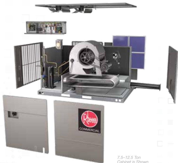
7.5-12.5 Ton Cabinet is Shown

From new construction to replacement projects and more, the new Rheem® Commercial Renaissance™ Line offers a breadth of commercial heating and cooling products that meet all design and application requirements. Whether your business is retail, hotels, restaurants, offices, schools, senior care or gyms, you'll have the ability to connect a new, customized Renaissance unit quickly and efficiently, providing comfort and peace-of-mind.