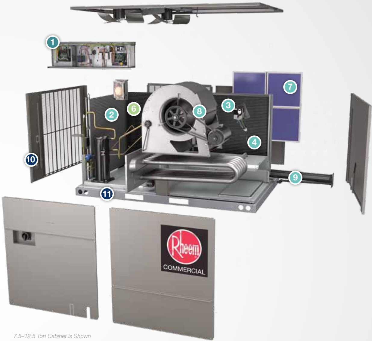
7.5–12.5 Ton Cabinet is Shown