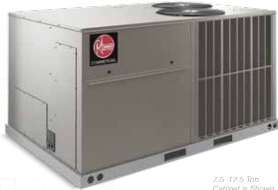
7.5-12.5 Ton Cabinet is Shown

:: customized solutions to help grow your business.